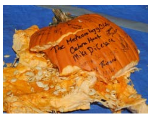
After the dropc