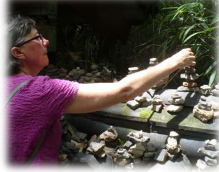
replaced family-run tea houses. And Western tourists were in abundance.

The rapid cultural change was tangibly evident in clothing styles. Three years ago, women aged 16 to 106 were wearing feminine dresses with high heels. Men of all ages were wearing suit pants, button-down collared shirts (often with ties and suit coats), and leather dress shoes. Now, the younger set has gone to brand-name oversize 'slogan' t-shirts, basketball-style or cut-off shorts, American jeans, and expensive athletic shoes. 'Goth' and 'retro' styles have made an appearance along with 'unnatural' hair colors and severely short styles.