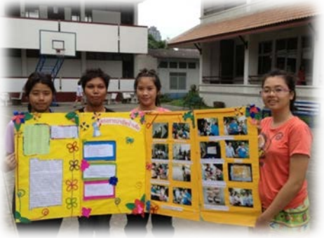
Experiential learning at Fatima Centre.

training workshops, coordinated by Commonwealth Secondary School, were run for primary and secondary teachers in Singapore. Commonwealth has implemented WAMSEAS to assess the constructed wetland on its campus. The Fatima Centre in Bangkok also joined the team this year. The Fatima residence school for disadvantaged girls included the water testing as part of their constructed wetland experiential learning project and not only did the Thai Ministry of Education, Department of Non-Formal Education pass the girls' project, they also invited some of the girls to the Ministry office to formally present their results.