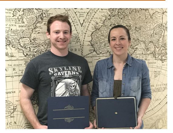
2018 Student Award Winners

Alumni—we want to hear from you! Where are you? What are you doing? Please contact a department faculty member so you can be featured in our next newsletter.