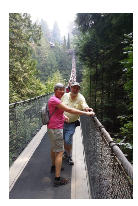
Capilano Suspension Bridge near Vancouver, BC.

Immediately on the heels of my return from Poland, a trip to British Columbia refreshed my Canadian cultural roots. Though views were inhibited by thick smoke from hundreds of regional forest fires, the mountains and oceans remained inspiring in their majesty and agelessness.