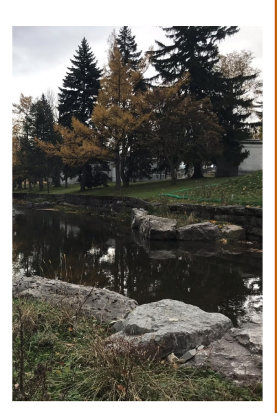
Fall foliage along Scajaquada Creek near campus.